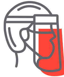
FACE SHIELD WORN WITH OTHER ACCEPTABLE MASK

*Note: we will have additional face masks available onsite for any attendee that requires one