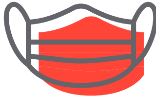
FDA-CLEARED SURGICAL MASK